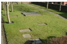
Turf Lane Quaker burial ground

In 1870s, isolated hamlets and houses in Stonepitfield were joined up by development, and became Duke Street, the main thoroughfare of Milnrow, which, building on the expertise of hand-loom woollen weavers, had become a centre for industrial woollen weaving. The weavers were well-served by a large number of cloggers in the area.